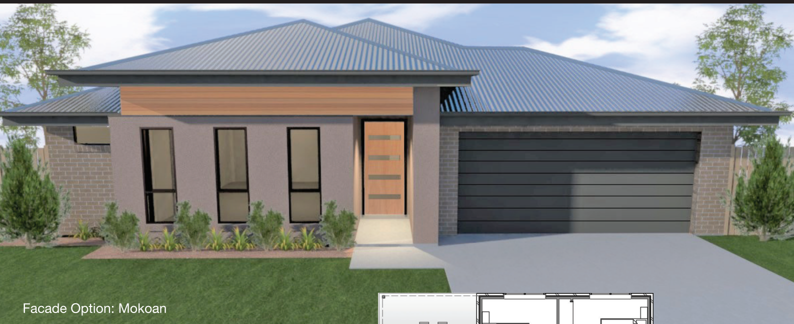
Facade Option: Mokoan